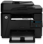
(HP LaserJet Pro MFP M226dn)

This powerful MFP increases productivity with automatic two-sided printing, an intuitive touchscreen with scan-to options, easy wireless connectivity, 1 built-in networking, security features, and mobile printing options. 8