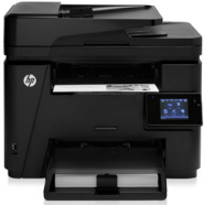
(HP LaserJet Pro MFP M226dw)