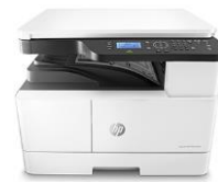
HP LaserJet MFP M42625dn