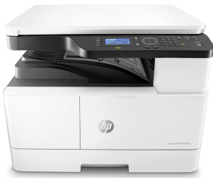
HP LaserJet MFP M42625dn